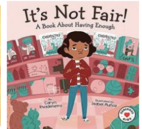
It's Not Fair! By Caryn Rivadeneira

https://bestkidsbooks.com/curations/5-best-picture-books-about-fairness/