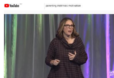
3 Ways to Get Intrinsic Motivation - Jessica Lahey

https://www.youtube.com/watch?v=Qb0l32bO5DA